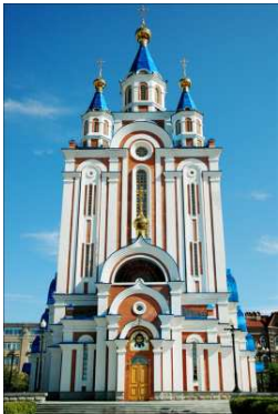
A Russian Church in Khabarovsk

His travels will take him to Calgary, Frankfurt, Germany and then to Moscow (a 24 hour trip). Here he will stay overnight and catch the connecting flight from Moscow to Khabarovsk the next day (another 9 hour flight equivalent to the Calgary-Frankfort portion of the trip the day before). Once in Khabarovsk he will be preaching and ministering prophetically at five public services a day for 8 days. Then, after a day of fellowship with the sponsoring pastor, he will head out on the return trip via Moscow, Frankfurt, Calgary and home. He will be gone from July 29th to August 10th and would greatly appreciate your prayers for all aspects of this trip including preparation time as he needs to have 40+ teachings prepared ahead of time.