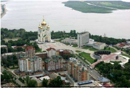
Khabarovsk city church and scenery

the government and in the country on a "religious visa" which means every event and activity he will be involved in must be recorded and registered ahead of time and his movements and activities will be closely monitored by the authorities.